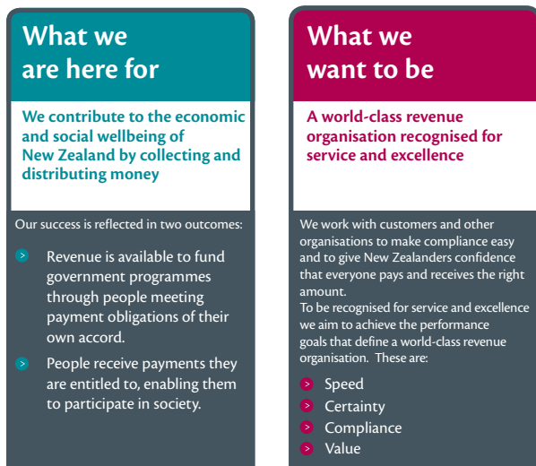
FIGURE 2— KEY ELEMENTS OF IR FOR THE FUTURE

Our long-term strategies are designed to respond to our challenges and guide us towards the organisation we want to be. IR for the future outlines our long-term intentions. It is our guide for what we want to be as an organisation and how we get there. It describes our role, outcomes and goals—see below.